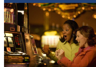
World-class Gaming and Excitement